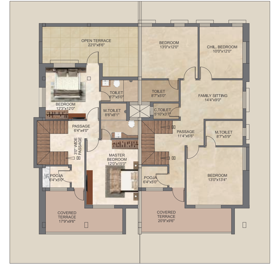
FIRST FLOOR PLAN (20)