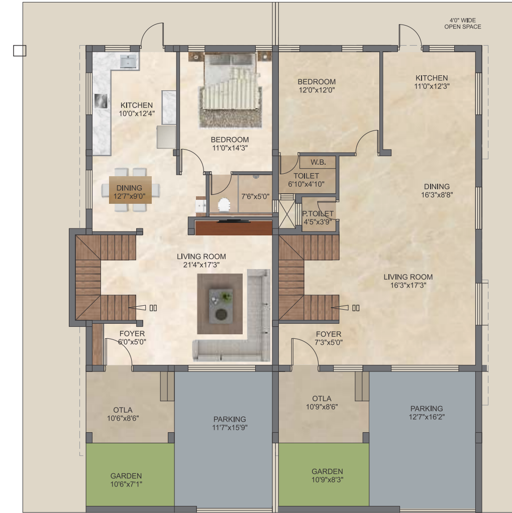
GROUND FLOOR PLAN (20)